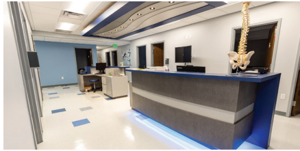
The spine center includes a Physical Medicine MD, X-ray, an internal injection suite and spine therapy — all under one roof.